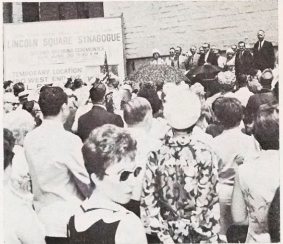
Ground Breaking Ceremonies, held on June 30, 1968 for our new Sanctuary at 69th Street and Amsterdam Avenue.