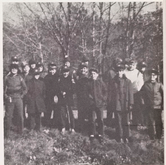
WEBELOS Scouts on Hike

Below is a photograph of some of the youngsters at the outset of a hike at Harriman State Park. Unfortunately or fortunately, we do not have a photograph showing how they appeared following the hike.