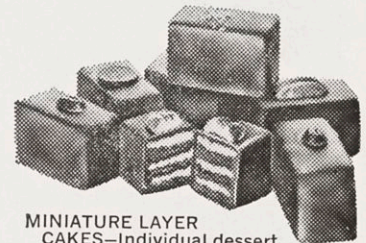
MINIATURE LAYER CAKES —Individual dessert size chocolate covered layer cakes in 5 exotic creme fillings—lemon, chocolate, filbert, raspberry, mocha and nut. Box of 12, $2.75