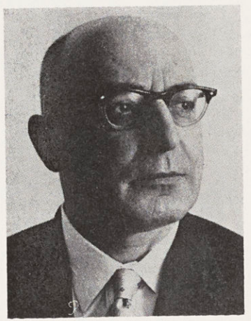
HON. PINCHAS SAPIR Minister of Finance in the Government of Israel

Worshippers will have an opportunity to greet the Minister at kiddush following services.