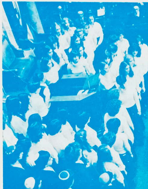
The Chorus of the Rabbi Joseph H. Lookstein Upper School sings " Yedid Nefesh " (Beloved of My Soul).