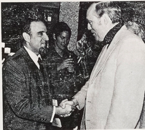
The Rabbi greeting United States Ambassador to Israel, Hon. Samuel Lewis, at a reception in Tel Aviv.