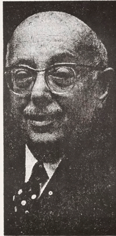
The New York Times

He was elected head of the Synagogue Council in 1975.