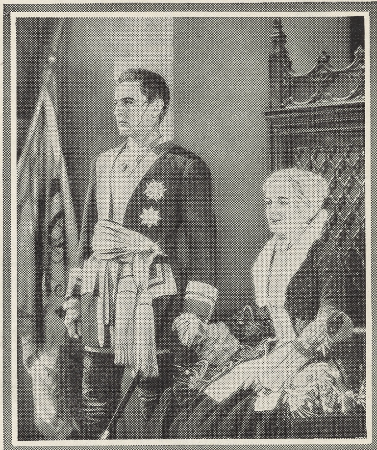
Scene from "General Crack" starring John Barrymore A Warner Bros. Production