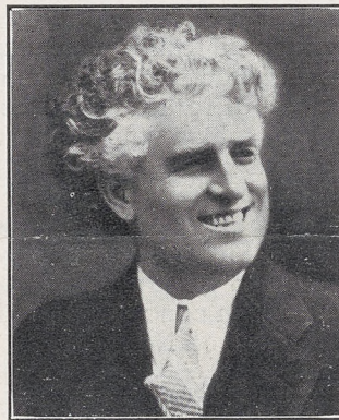
GIOVANNI MARTINELLI Tenor