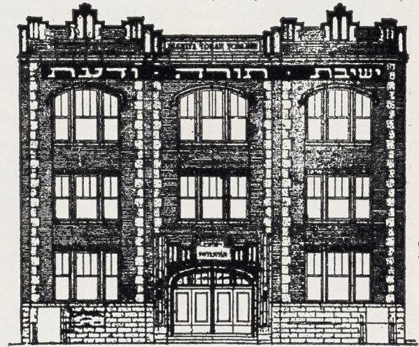
206-8-10 WILSON STREET

Whereas the Yeshivah is practically a local institution, serving greater New York and vicinity, the Mesifita has become a Torah Institute of national scope, attracting