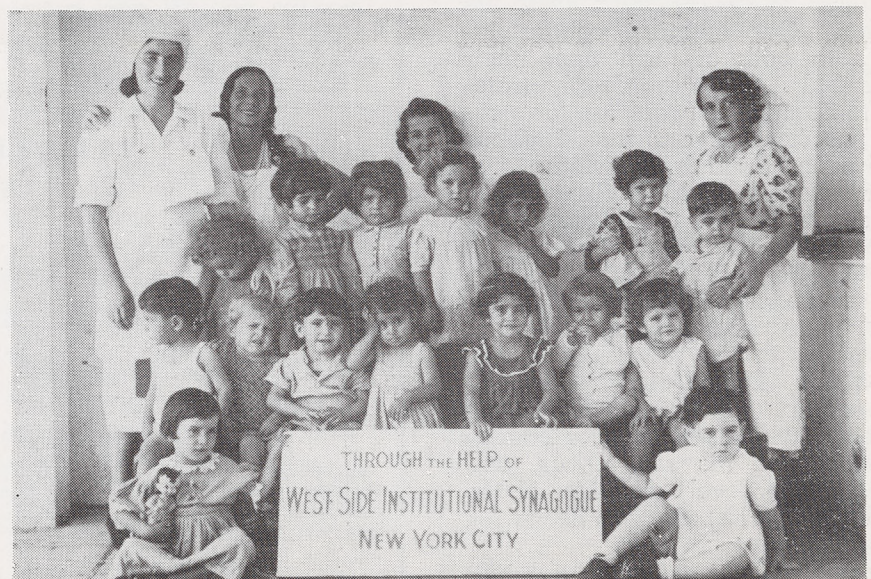
First batch of children of our Nursery in Pardessia (on the main road between Tel Aviv and Haifa)