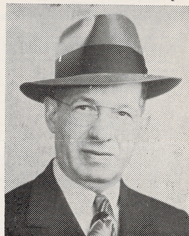
Pres. of Jewish Community School

The EIGHTH ANNUAL DINNER of the JEWISH COMMUNITY SCHOOL is being held on SUNDAY EVENING, NOVEMBER 25th, at the HOTEL AM-BASSADOR.