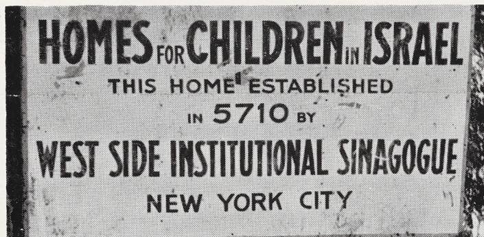
"Sday Chemed" in Nachalat Jehudah, Rishon L'Zion.