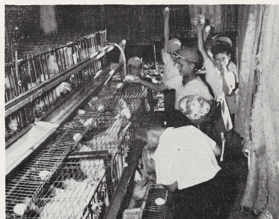
The hennery at our Children's Village which is being taken care of by the children themselves.