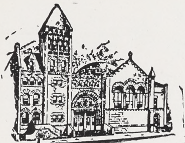
West Side Institutional Review

Published weekly from the Second Friday in September to the Second Friday in June by the West Side Institutional Synagogue, 120-138 West 76th Street, New York 23, N. Y. Tel. TRafalgar 7-8281. Subscription: One Dollar Per Year.