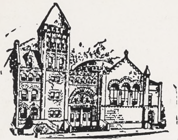
West Side Institutional Review

Published weekly from the Second Friday in September to the Second Friday in June by the West Side Institutional Synagogue, 120-138 West 76th Street, New York 23, N. Y. Tel. TRafalgar 7-8281. Subscription: One Dollar Per Year.