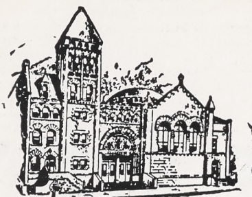
West Side Institutional Review

Published weekly from the Second Friday in September to the Second Friday in June by the West Side Institutional Synagogue, 120-138 West 76th Street, New York 23, N. Y. Tel. TRafalgar 7-8281. Subscription: One Dollar Per Year.