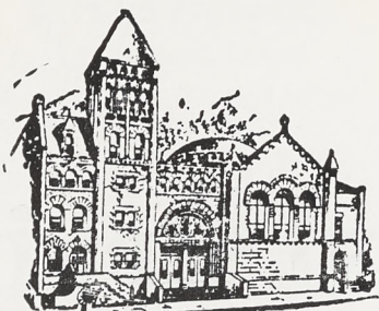
West Side Institutional Review

Published weekly from the Second Friday in September to the Second Friday in June by the West Side Institutional Synagogue, 120-138 West 76th Street, New York 23, N. Y. Tel. TRafalgar 7-8281. Subscription: One Dollar Per Year. Entered as second class matter Sept. 22, 1938, at the Post Office at New York, N. Y. under the Act of March 3, 1879.