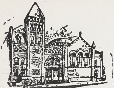
West Side Institutional Review

Published weekly from the Second Friday in September to the Second Friday in June by the West Side Institutional Synagogue, 120-138 West 76th Street, New York 23, N. Y. Tel. TRafalgar 7-8231. Subscription: One Dollar Per Year. Entered as second class matter Sept. 22, 1938, at the Post Office at New York, N. Y. under the act of March 3, 1879.