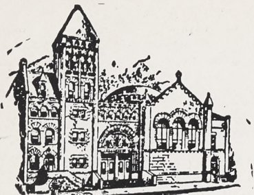
West Side Institutional Review

Published weekly from the Second Friday in September to the Second Friday in June by the West Side Institutional Synagogue, 120-138 West 76th Street, New York 23, N. Y. Tel. TRafalgar 7-8281. Subscription: One Dollar Per Year. Entered as second class matter Sept. 22, 1938, at the Post Office at New York, N. Y. under the act of March 3, 1879.