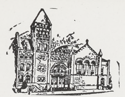
West Side Institutional Review

Published weekly from the Second Friday in September to the Second Friday in June by the West Side Institutional Synagogue, 120-138 West 76th Street, New York 23, N. Y. Tel. TRafalgar 7-8281. Subscription: One Dollar Per Year. Entered as second class matter Sept. 22, 1938, at the Post Office at New York, N. Y. under the act of March 3, 1879.