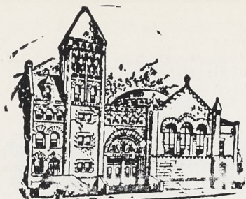
West Side Institutional Review

Published weekly from the Second Friday in September to the Second Friday in June by the West Side Institutional Synagogue, 120-138 West 6th Street, New York 23, N.Y. Tel. TRafalgar 7-8281. Subscription: One Dollar Per Year. Entered as second class matter Sept. 22, 1938, at the Post Office at New York, N.Y. under the act of March 3, 1879.