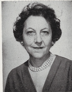
Guest of Honor