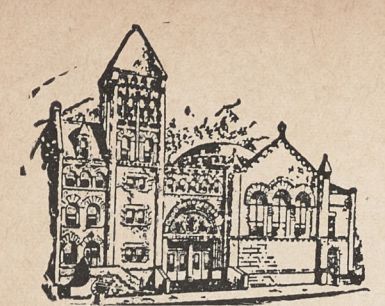
West Side Institutional Review

Published weekly from the Second Friday in Jeptember to the Second Friday in June by the West Side Institutional Synagogue, 120-138 West 6th Street, New York 23, N Y. Tel. TRafalgar 7-8281. Subscription: One Dollar Per Year. Entered as second class motter Sept. 22, 1938, at the Post Office at New York, N .Y. under the act of March 3, 1879.